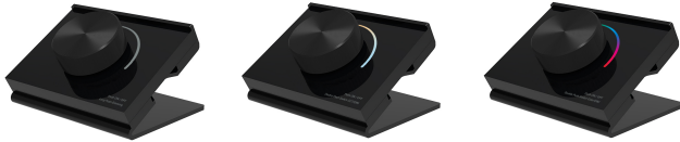
RK1 1 Zone Dimming

Rotary dimming/1-3 color/Wireless remote 30m distance/CR2032 battery